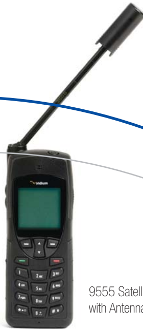
9555 Satellite Phone with Antenna